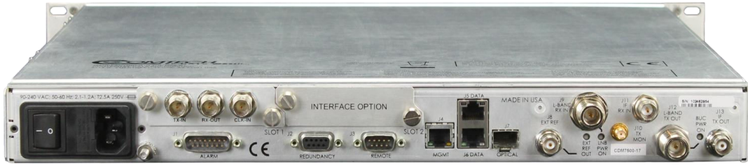
CDM-760 Back Panel